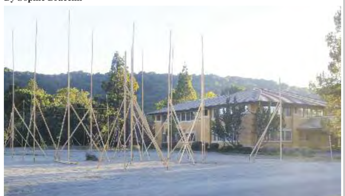
Story poles along Moraga Way help the town and its residents visualize a planned development.